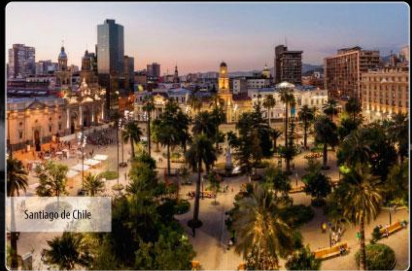
Santiago de Chile

El Galeon Restaurant: Customers can watch the preparation process, though there's no doubt how attractive our dishes can be to their visitors. The service, friendliness and personal attention is a priority at this restaurant, details make the difference.