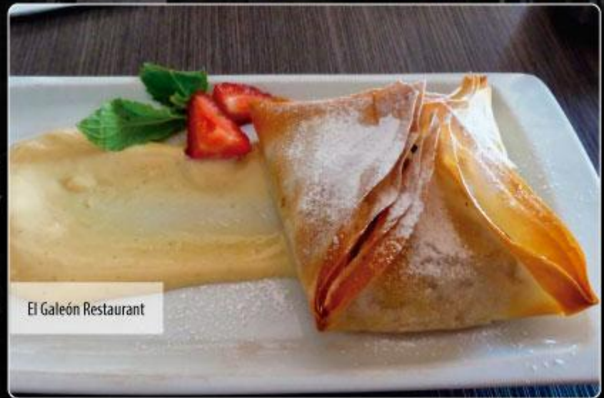
El Galeón Restaurant